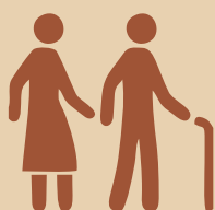
SENIOR CITIZEN PARK