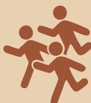
MULTIPURPOSE SPORTS COURT