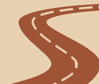
CONCRETE ROAD WITH PAVERS